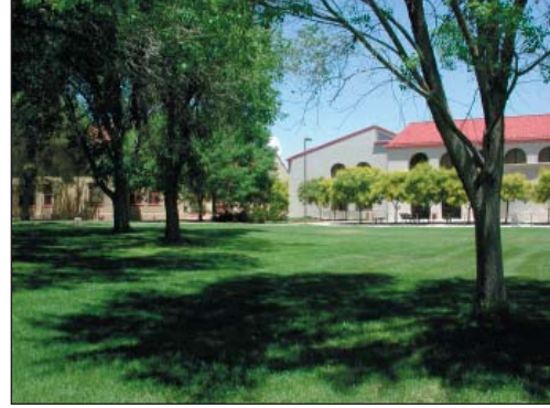
New Mexico Tech Campus