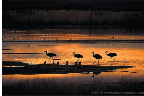
Bosque del Apache