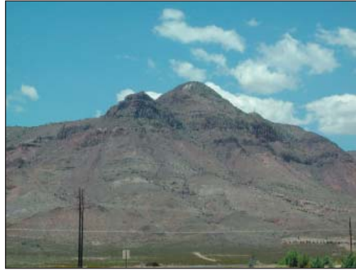
New Mexico Tech Mountain Outside Socorro

This economic development plan is intended to be used by stakeholders in Socorro County. It is intended to build upon the strengths of the County and its communities while providing clear strategies that will help the County meet economic development challenges. In providing economic development strategies, this section analyzes current economic conditions, identifies strengths and challenges, and seeks out opportunities that economic development stakeholders in the County can capitalize upon to facilitate economic growth.