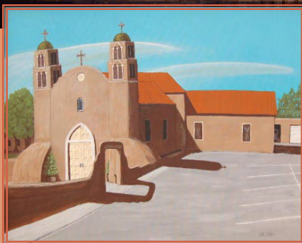
San Miguel Parish Mission Prints